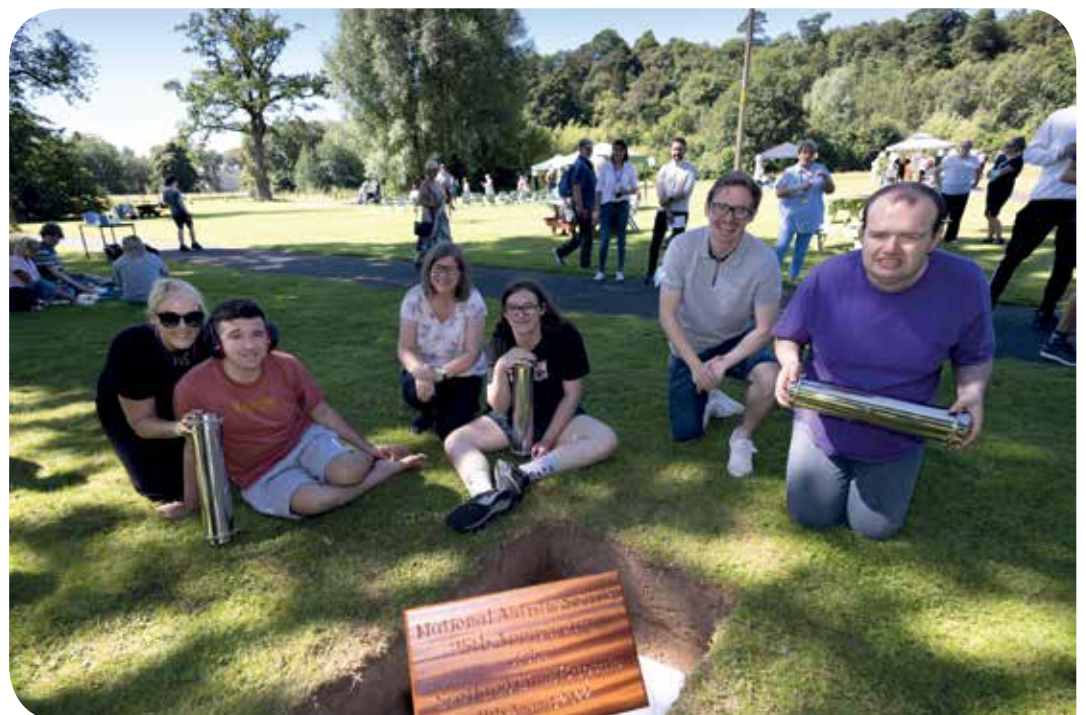
Our staff and the people we support in Catrine had a brilliant time!

themselves. I think the face painting, music, horse-riding and ice-cream van were the highlights! It was a great way for us to recognise the positive contribution our staff have made to the lives of autistic people across Scotland in the last 25 years."