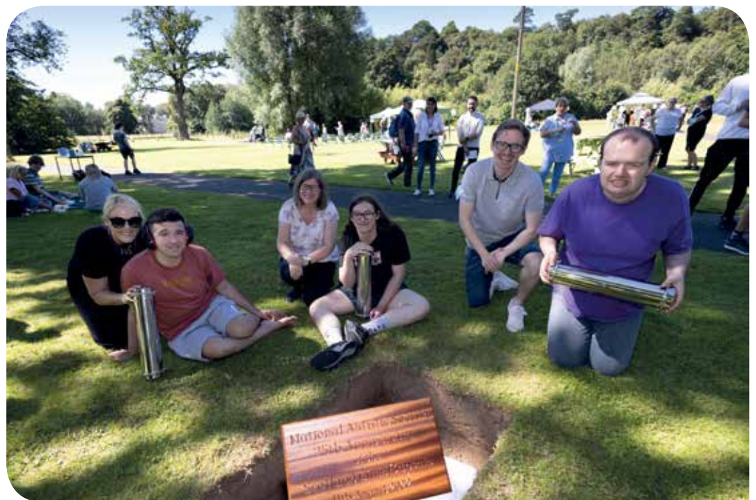
Our staff and the people we support in Catrine had a brilliant time!

themselves. I think the face painting, music, horse-riding and ice-cream van were the highlights! It was a great way for us to recognise the positive contribution our staff have made to the lives of autistic people across Scotland in the last 25 years."